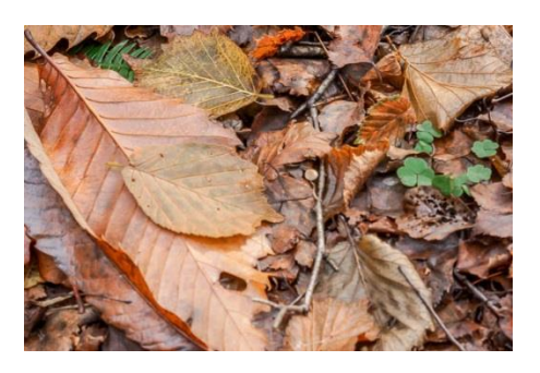
Leaves Find 5 different shapes Are any leaves still green?

Acorns Can you find an oak tree? Draw the shape of an oak leaf.