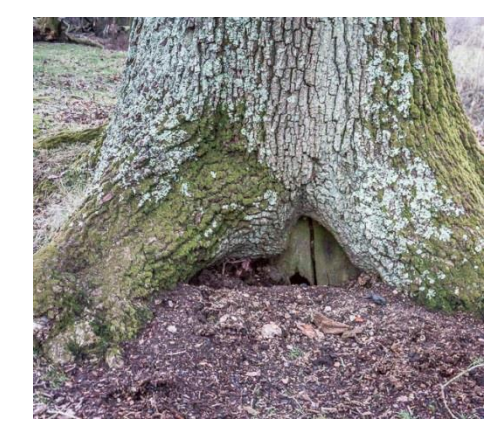
Opening at bottom of tree Can you find a hole for an animal to live in?