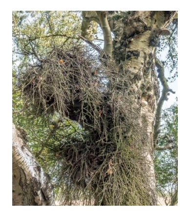
Bird's nest Can you find a bird's nest?