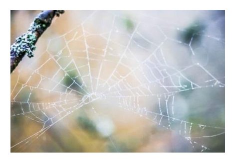
Spider Webs Can you see any spider webs?