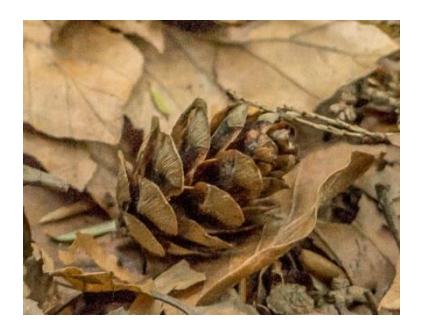
Cones How many different shapes can you find?