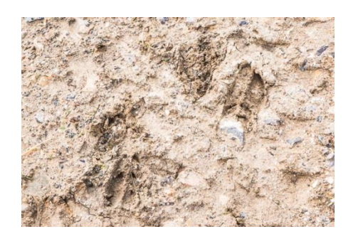
Tracks Can you find any animal tracks?